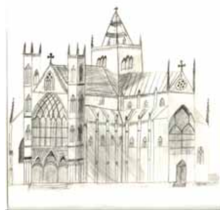
The language of the Church, and therefore of our hearts, is Latin.

Description: This course moves at a standard pace; book is completed in one year. Grading is included. Online access is provided for tests, quizzes, and games for additional review.